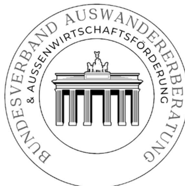
The official Logo of the BVAA. e.V.

But that's not all: In Autumn, he was even elected President of the corresponding Professional Association. He is now President of the German Federal Association for Emigration Counselling and Foreign Trade Promotion (Bundesverband Auswandererberatung und Außenwirtschaftsförderung e.V. – BVAA e.V.) in Berlin.